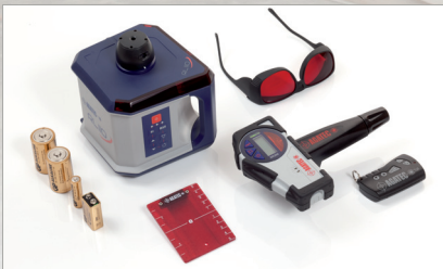
Agatec RL110 scope of delivery