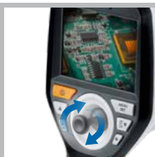
Manual 3D control