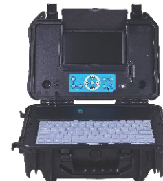
1 × Control Box